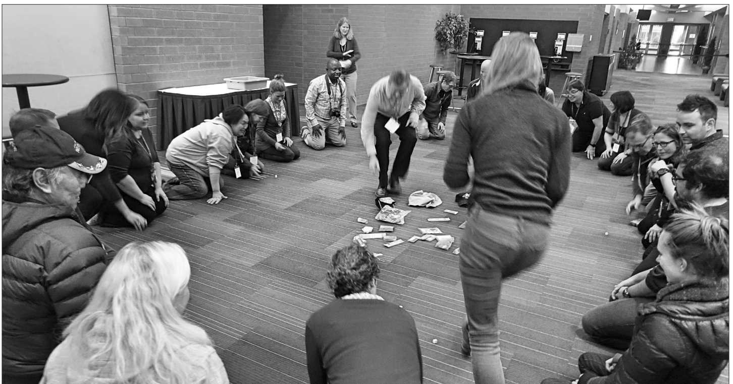
Workshop participants take a break to play a dice game in the hallway of the convention center.