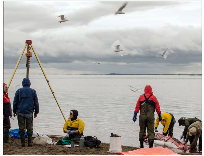
Community members and scientists take samples of beluga whales harvested at Hendrickson Island, Northwest Territories.

Programs have a greater chance of sustainability at the community level when their focus is on something that has cultural and/or local economic value. An example is the beluga monitoring program, where beluga is an important food source, has strong cultural value, and is an important part of the sharing economy for Inuvialuit residents. The beluga monitoring program supports a land camp, which contributes to TK transmission and thus engages cultural values beyond the project. The community and researchers are able to leverage funding for this program, allowing them to work together on a common goal. The project has been sustained because community members see value in different components – the program creates jobs and trains residents to collect samples. The scientists return to the community to share information on a regular basis, visiting harvesters in their homes. The Guardian program (not present at the workshop) was mentioned as an example of a holistic monitoring program that also has been sustainable.