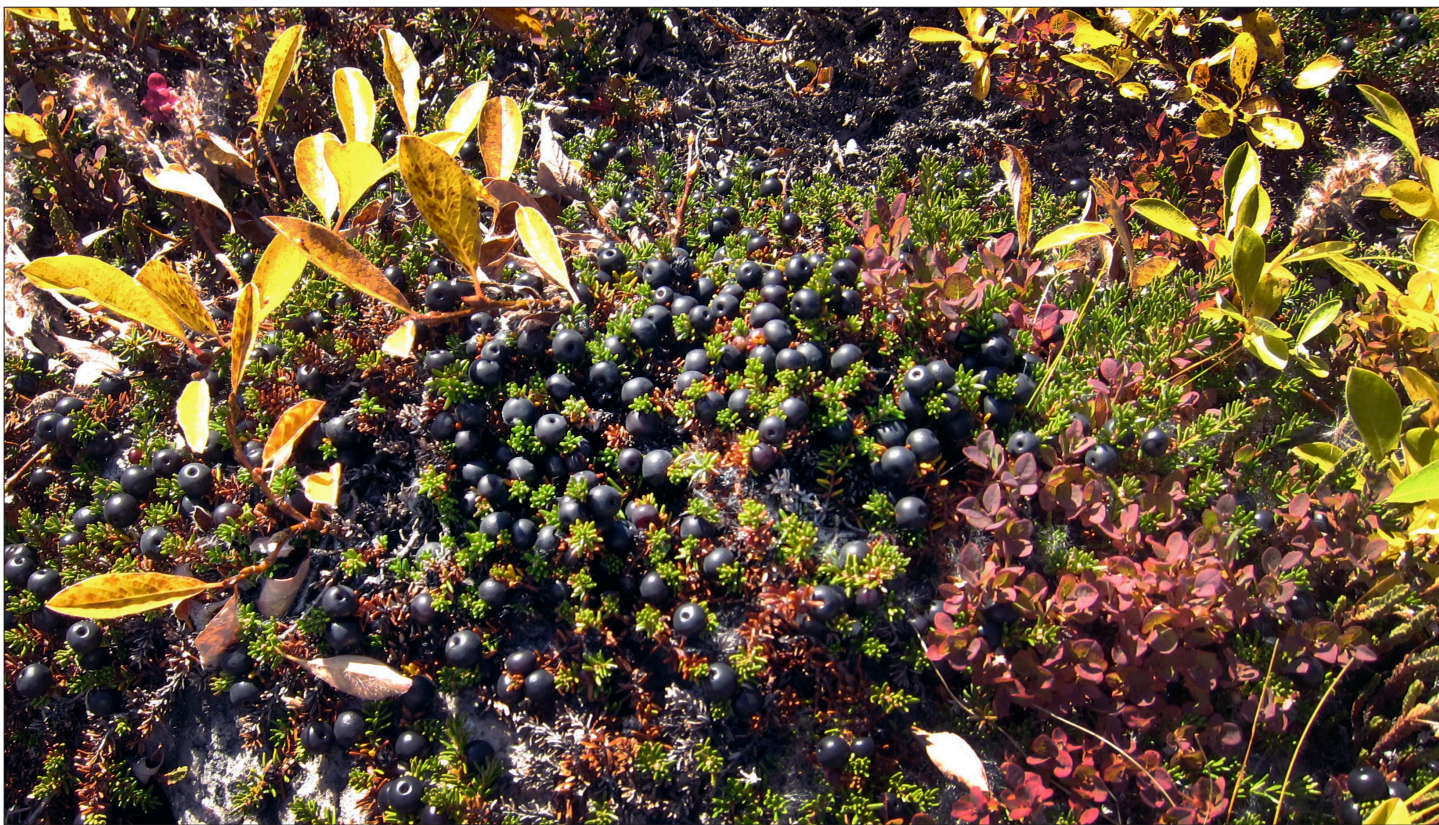
Crowberry plants ripen on the summer tundra on Baffin Island, Nunavut.

on other programs and how people behave when it comes to knowledge local people have. Another example shared was of a landslide in Svalbard, Norway, that killed several residents and destroyed houses. Surviving residents felt they were not properly informed of the danger by government, and that their concerns about persistent risks were not taken into account.