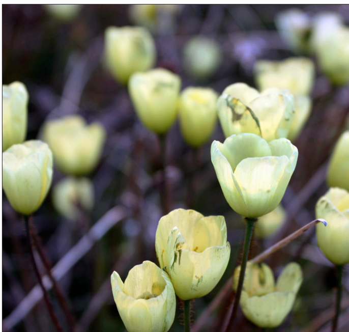
Arctic poppies bloom.

For example, a network might agree to collect standardized data on sea ice and to gain a better understanding of how sea ice is changing regionally and at a circumpolar scale. Networks can also be avenues for sharing challenges or failures—what doesn't work and why. They could contribute to documentation of the social learning that happens around CBM at the community level, such as who is using the data and information generated. Networks could support development and implementation of monitoring and evaluation of CBM programs.