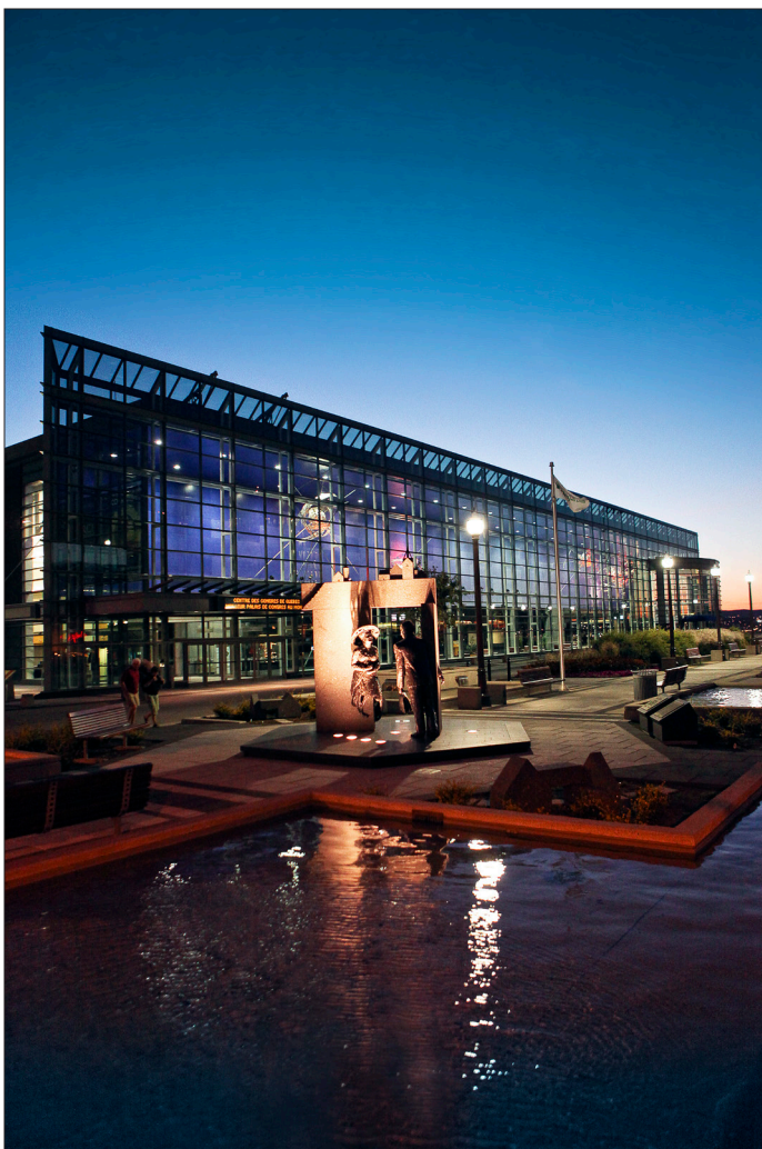
The Quebec Convention Center is illuminated at night.