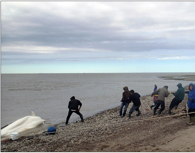
Community members haul in beluga whales at East Whitefish, a whaling camp for Inuvik in the Northwest Territories, Canada.