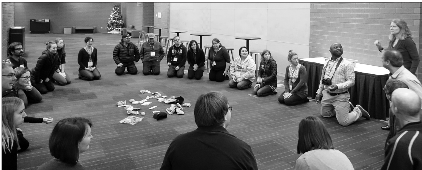
Workshop participants take a break to play a dice game in the hallway of the convention center.

length). Through technological innovation and science, SmartICE strives to integrate and augment (not replace) Indigenous knowledge about local sea-ice conditions while involving communities in all aspects of its operation and decision-making.