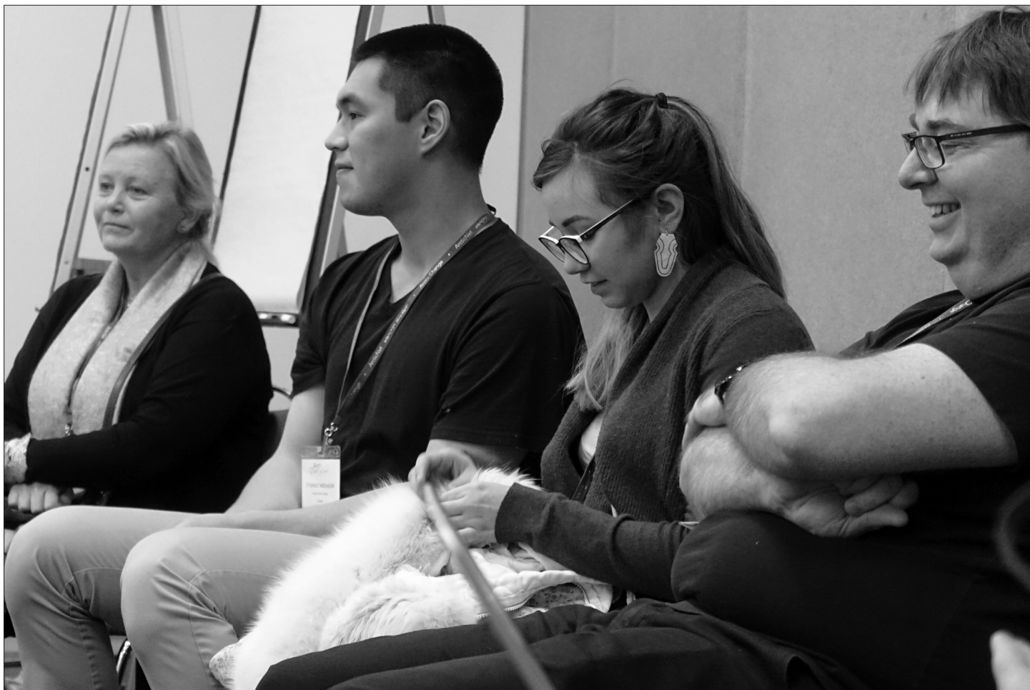
Workshop participants enjoy a moment of humor.

Inuktitut sea ice terminology, wildlife species and other entities linked to wikis and profiles such as organizations, projects, regions, communities, and tools. It hosts information from community-driven research networks across the Canadian Arctic and has capabilities for a wide variety of information types including participatory mapping, hunting stories, oceanographic, sea ice and biological data. A wide variety of educational tools are also integrated and linked to school curriculum including interactive media like Google street view of remote sea ice. It is a project-independent platform that puts Inuit first and foremost in the design and structure for the interface, database and intellectual property management. It allows communities spread over vast distances to share observations and collaborate and lead their own networked research programs.