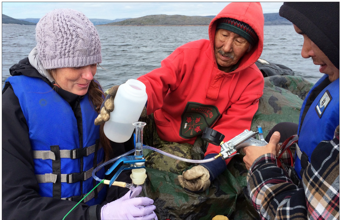
Local guides help filter water samples to analyze the George River water quality during the 2017 Science Land Camp, part of Imalirijiit community-based environmental monitoring program in Nunavik.

AVATIVUT (which means “our environment” in Inuktitut) is an educational program that works with elders and school age youth (secondary level) to learn about science and traditional knowledge through hands-on, land-based activities. The program (currently on hold) collected data on berry productivity, ice processes and permafrost dynamics in several communities in Nunavik. IMALIRIJIIT (means water quality researchers in Inuktitut) is a new project, now in its second year, based in George River, Nunavik. It is driven by the desire to build capacity within communities and community concerns about rare earth mining in the George River Watershed. Project activities involve students, scientists, and traditional knowledge holders and other community members and include land based scientific camps. Water quality, biofilm, benthos, sediments, lichen and contaminants in country food are being monitored with sample kits and documented in an interactive map.