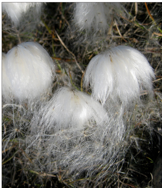
Arctic cotton blooms. Inuit traditionally used the seed heads as wicks in seal oil lamps.

Participants noted that CBM is not just a “fancy monitoring program” – it needs to be meaningful to communities. Part of this is demonstrating that the information is feeding into decision-making. For example, the Nunavut Wildlife Management Board uses CBM data in its population assessments of wildlife for setting harvest levels.