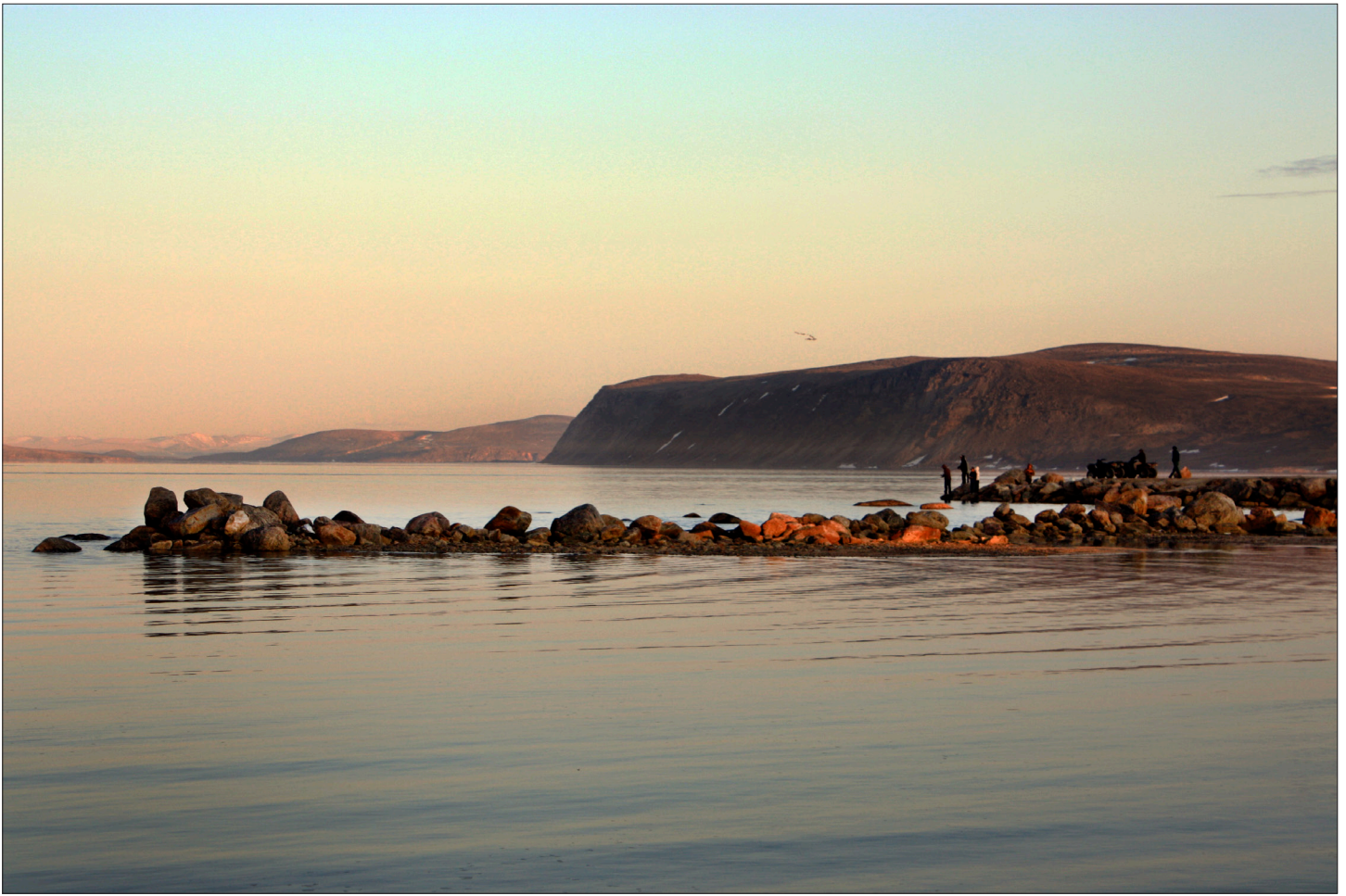
Children jig for fish on the boat landing at Kangitugaapik, Nunavut. Community-based monitoring programs that engage youth can also support transmission of Traditional Knowledge by teaching land skills and encouraging interaction with knowledgeable hunters and elders.

forums to consult about data products and data sharing to ensure that products are relevant. “This gives them a sense of management, control and trust.” They also request that if community members want to share the information with people from outside the community, they need to consult with individuals involved with the project so that it can be shared correctly. Communities also want to make sure that information and data are properly verified from within the community; data uploaded into databases needs to come from a reliable source, such as community observers who are preapproved. This is critical when it comes to sea ice, for example, to ensure safe travel.