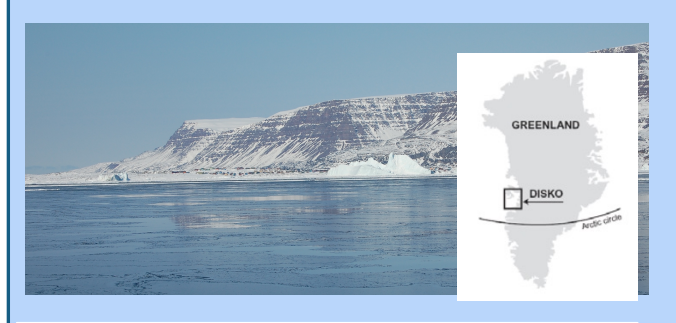
Figure 2. Picture from Disko Bay