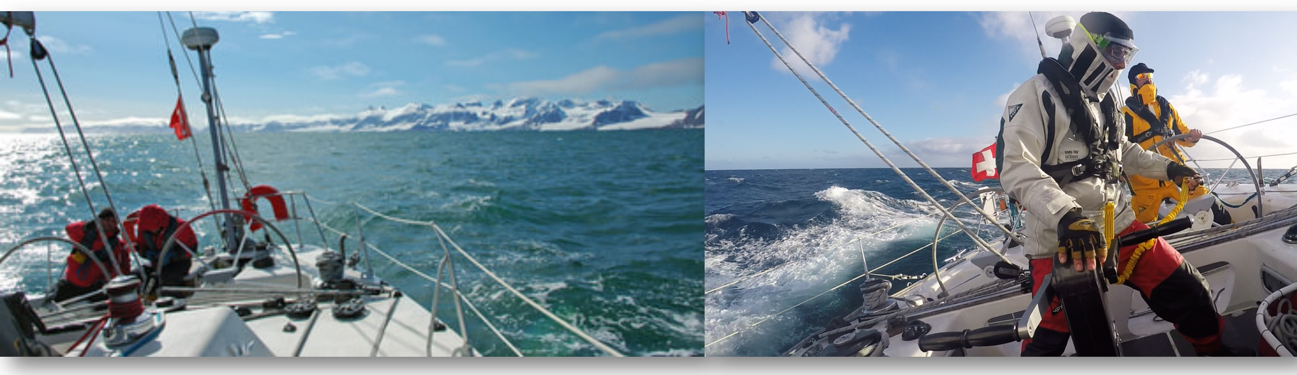
AECO - Monitoring Workshop - Svalbard March 2019